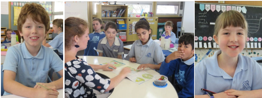
In the Stage 2 class the children were busy with reading and learning their spelling.