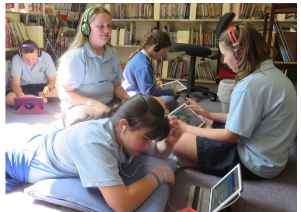
The Stage 3 class busy with an online Mathletics class

Children will need to wear school shorts, polo shirt, hat and joggers. They will also need morning tea, lunch and at least one large water bottle. We will be taking Terry's bus. We will return in time for the afternoon bus run. In the case of wet weather an announcement will be made after 7.30am on 2MG, ABC FM and ABC AM. If the day is postponed due to wet weather, children will be expected to come to school as normal.