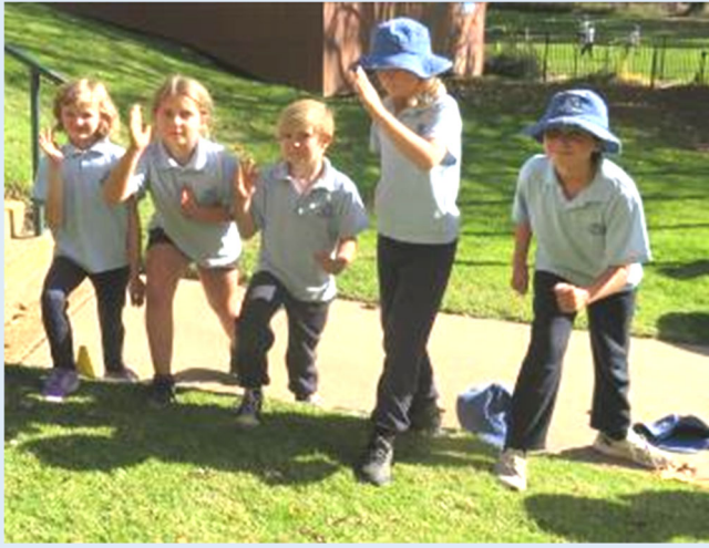
Ready, set, go!