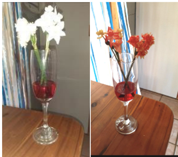
Cassie's before and after Science experiment

Cassie put flowers into coloured liquid and watched as they "drank" the liquid and changed colour