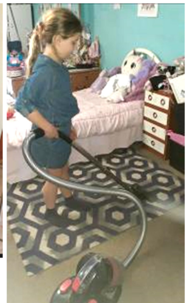
Cassie has been helping at home by keeping her room clean

Cassie put flowers into coloured liquid and watched as they "drank" the liquid and changed colour