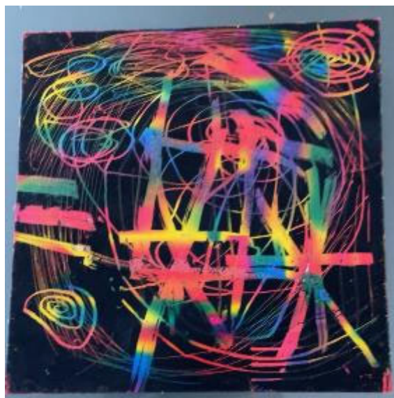
David's Scratch Art