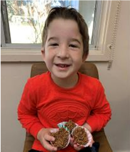
Beau's tasty Chocolate Crackles