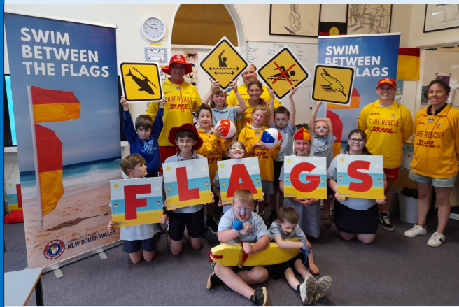
Beach to Bush!