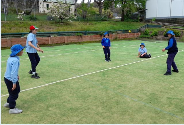
Handball is popular at the moment