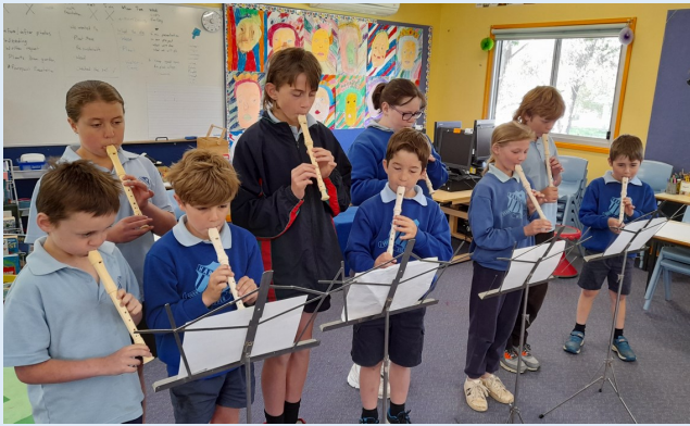
Practising for Presentation Night!