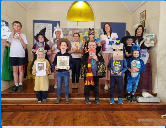
Celebrating Book Week!