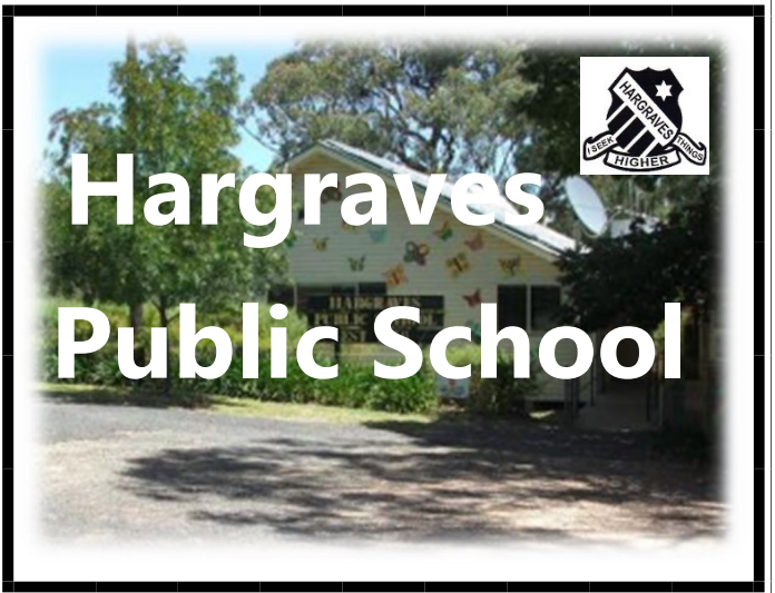
9 September 2022