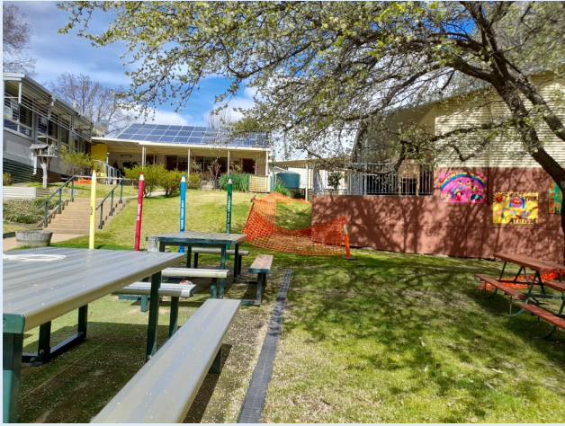
Enjoying the spring weather!