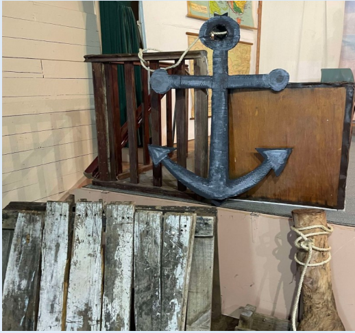
Excitement is building .....