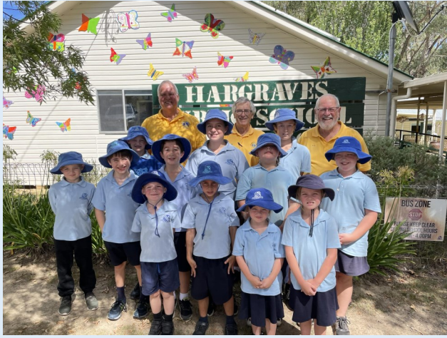
Lion's Club Eye Screening