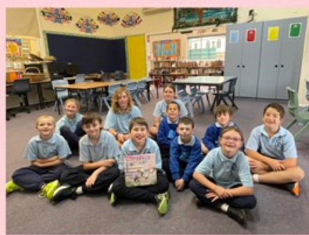
National Simultaneous Storytime 2025